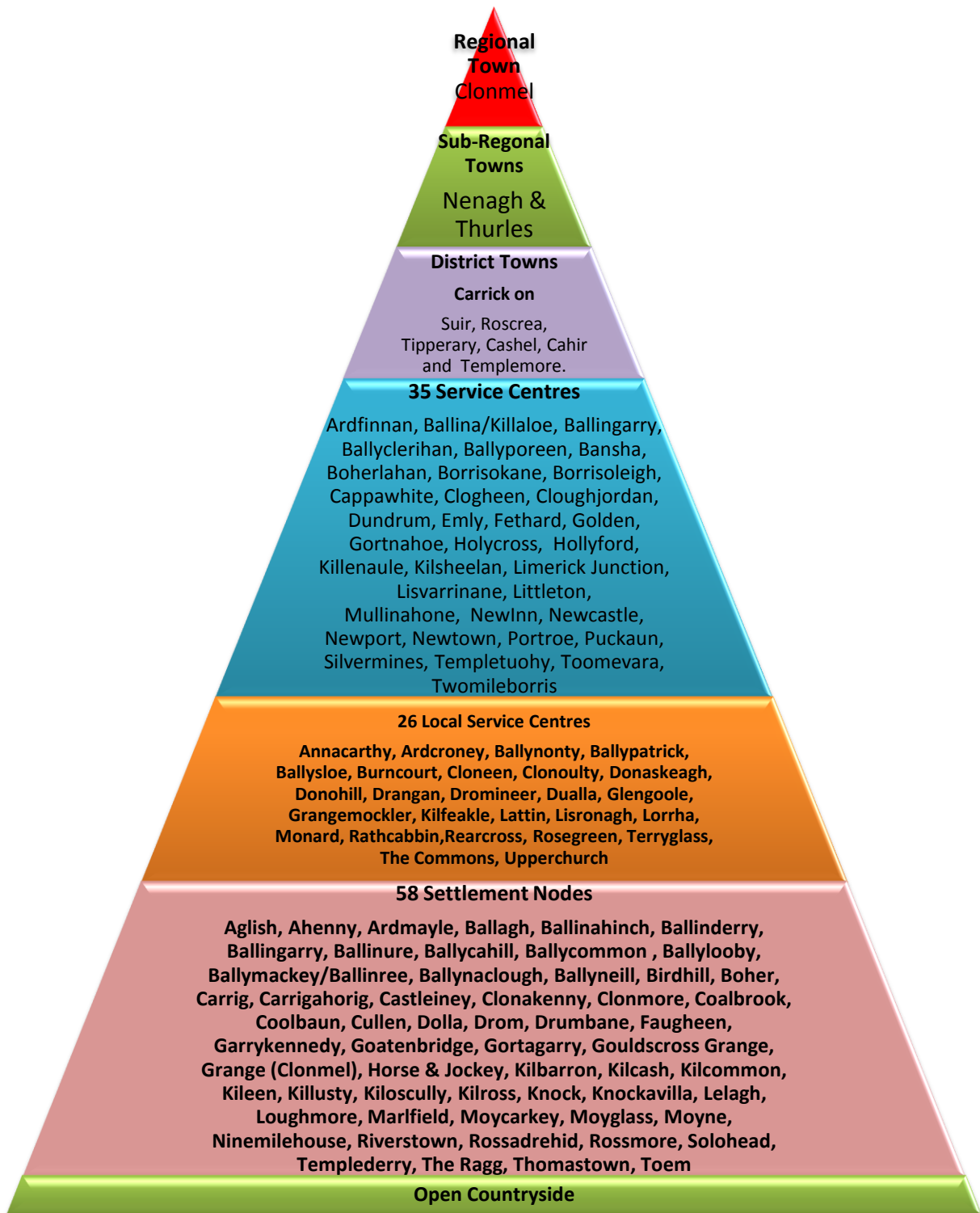
Figure 1: Tipperary County Settlement Hierarchy